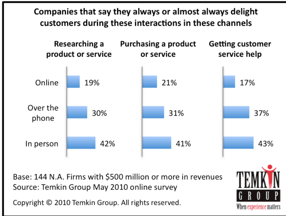
Figure 1: Companies Do Not Delight Customers Online